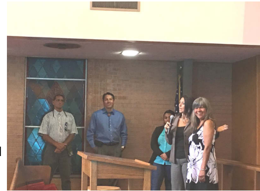
American Indian Justice Navigation Council