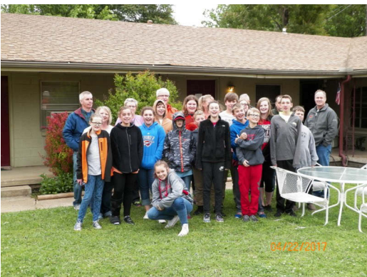
The children of Claremore 1st UMC delighted Exodus House residents & staff with a visit.